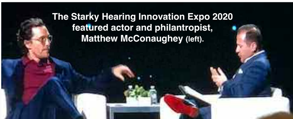
The Starkey Hearing Innovation Expo 2020 featured actor and philanthropist, Matthew McConaughey (left).

Making sure you stay engaged and connected is first and foremost when we design your treatment plan. Thanks to Starkey and its latest advances, that goal is more achievable than ever. ✨